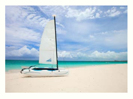
Turks & Caicos