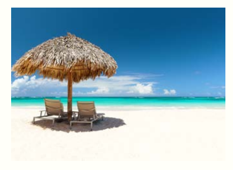
Punta Cana, Dominican Republic